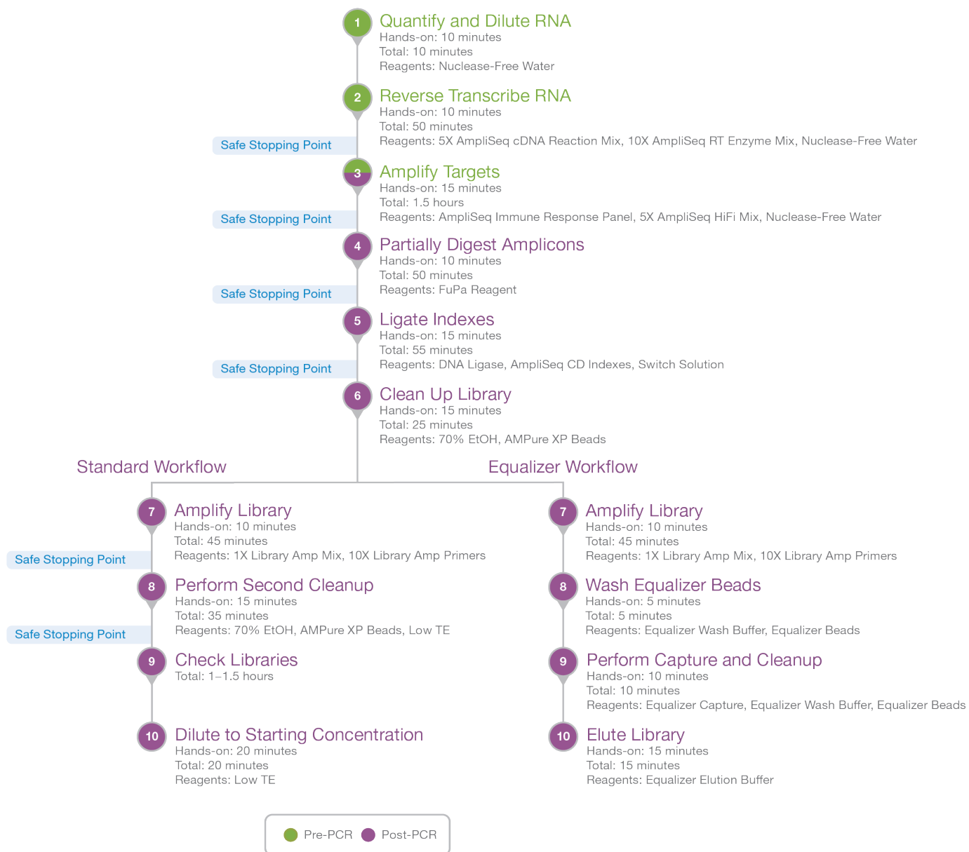
Figure 1 AmpliSeq Immune Response Panel Workflow

The following diagram illustrates the AmpliSeq for Illumina Immune Response Panel workflow. Safe stopping points are marked between steps.