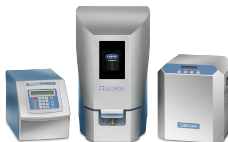
Figure 1: The Q800R2 Sonicator —The Q800R2 Sonicator (Qsonica LLC) demonstrates excellent DNA fragment size control and reproducibility for Illumina library preparation kits.

Four DNA sample replicates (QS1–QS4) were prepared from a human lymphocyte cell line (Coriell Institute for Medical Research, NA12878). To obtain 350 bp average insert sizes, DNA samples were sonicated in separate, generic, polypropylene tubes on the Q800R2 Sonicator (Qsonica, Model No. Q800R2) with identical instrument settings (Table 1). The white Qsonica tube holder was used (Qsonica, Part No. 4256), although several options are available for a variety of sample type and throughput needs (Table 4). Samples were quality checked for fragment size and fragment uniformity on the Fragment Analyzer (Advanced Analytical) using the High Sensitivity NGS Fragment Analysis Kit (Advanced Analytical Cat No. DNF-474). Four