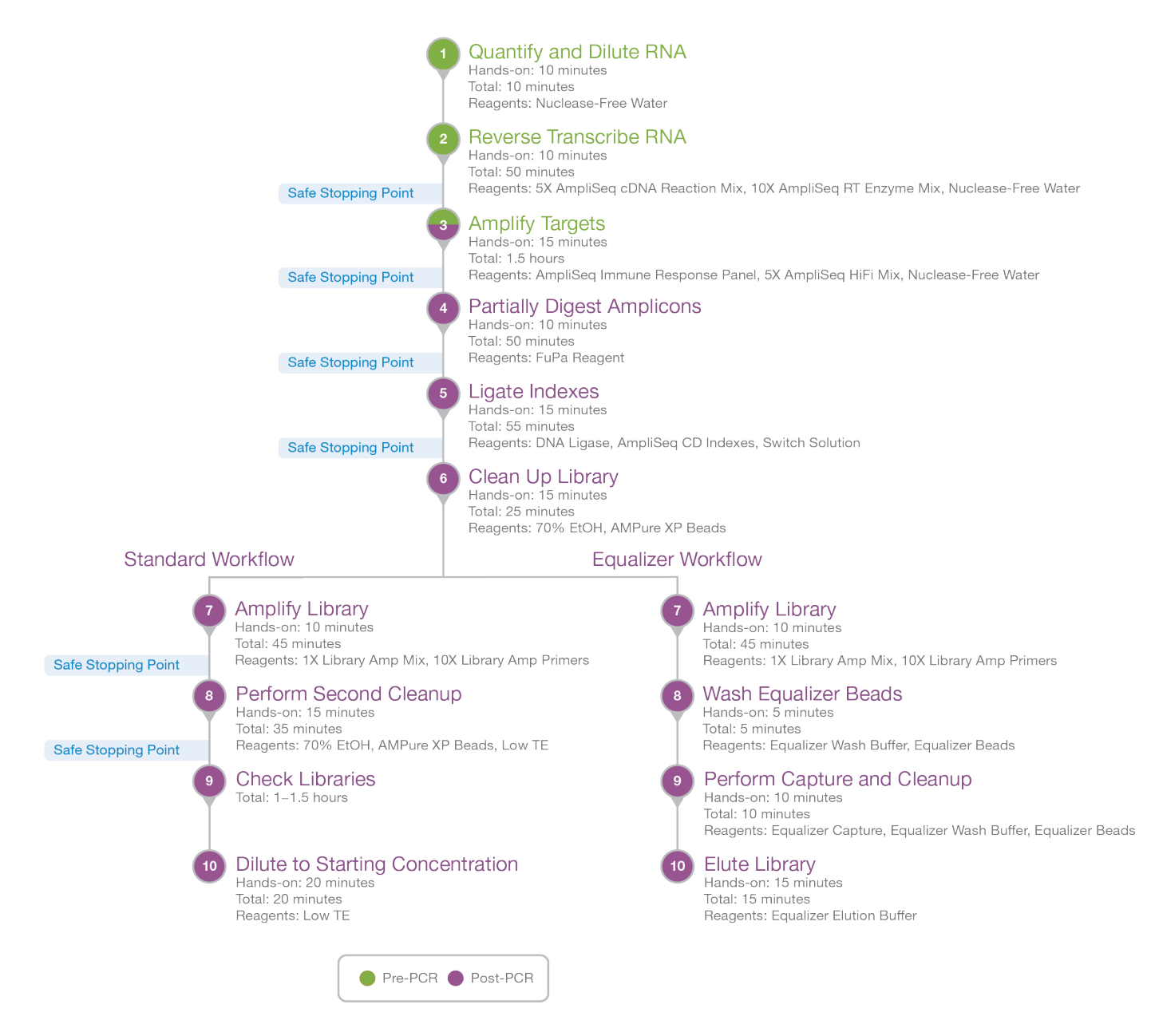
Figure 1 AmpliSeq Immune Response Panel Workflow

The following diagram illustrates the AmpliSeq for Illumina Immune Response Panel workflow. Safe stopping points are marked between steps.