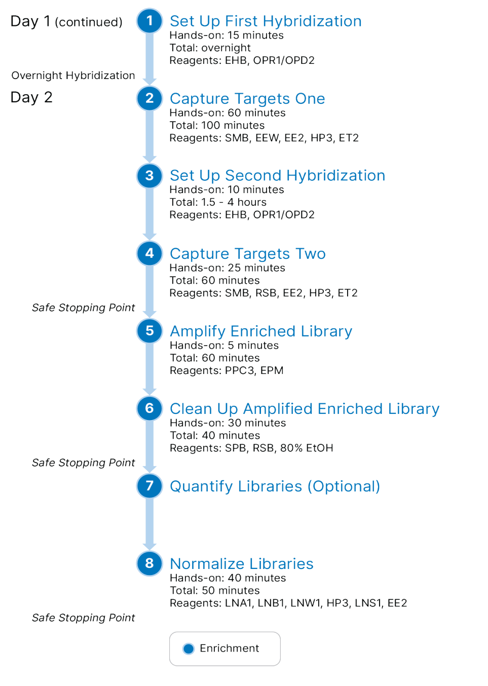
Figure 4 TruSight Oncology 500 High Throughput DNA and RNA Workflow (Part 2)

The following diagram illustrates the recommended DNA and RNA enrichment workflow using a TruSight Oncology 500 HT kit. Safe stopping points are marked between steps. Hands-on and total times are approximate.