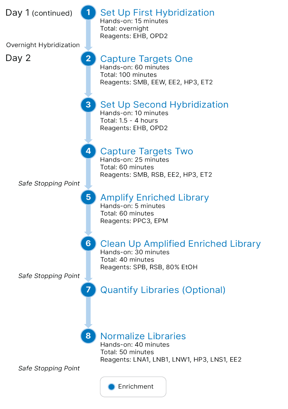
Figure 2 TruSight Oncology 500 High Throughput DNA Only Workflow (Part 2)

The following diagram illustrates the recommended DNA only enrichment workflow using a TruSight Oncology 500 HT kit. Safe stopping points are marked between steps. Hands-on and total times are approximate .