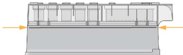
Figure 1 Maximum Water Line