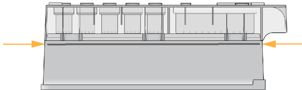
Figure 1 Maximum Water Line