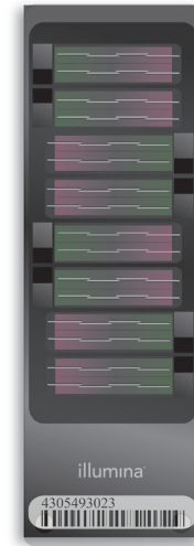
Figure 1: The Infinium MethylationEPIC v2.0 BeadChip—The Infinium MethylationEPIC v2.0 BeadChip features > 935,000 CpGs in enhancer regions, gene bodies, promoters, and CpG islands.

DNA methylation plays an important role in regulating gene expression. Changes in cellular DNA methylation states have long been implicated in aging, development, and disease pathology. 1,2 For over a decade, Illumina has provided researchers with robust microarray-based tools powered by BeadArray™ technology to measure DNA methylation across the genome quantitatively. To date, the Infinium HumanMethylation450 and MethylationEPIC v1.0 BeadChips, have been used by the research community to drive data collection for epigenome-wide association studies (EWAS). These Infinium BeadChips have enabled both the discovery and application of methylation-based biomarkers in the fields of cancer research, 3,4 genetic diseases, 5 aging, 6 and molecular epidemiology. 7 The updated Infinium MethylationEPIC v2.0 BeadChip (Figure 1, Table 1), built upon the same reliable Infinium chemistry foundation, offers enhanced, expert-selected content, to enable more biological discoveries in a new era of epigenetics research.