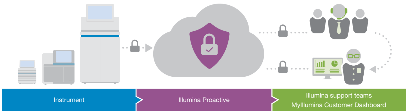
Figure 1: Illumina Proactive secure data flow—The flow of instrument performance data collected by Illumina Proactive, from the instrument to Illumina and out to you the customer, is secured through various administrative, physical, and technical controls to ensure data privacy. 1

The Illumina Proactive instrument performance service is not able to access genomic data (sequencing run data), personally identifiable information (PII), or protected health information (PHI) (Figure 3). Only instrument performance data, run performance data, instrument configuration data, and run configuration data, are sent by the instrument to Illumina in a secure data stream (Figure 1).